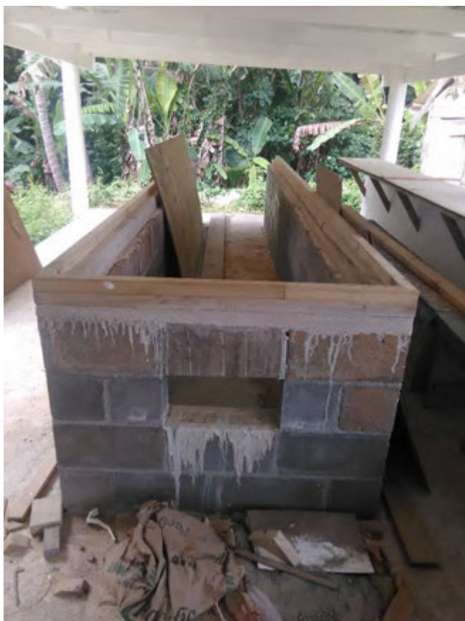
Atiu cold press coconut oil project progress to date

Mia Teaurima the SRIC Project Coordinator was recently in Atiu to check on the progress of projects including the cold press coconut oil project. The building for the coconut project has been ready since April, leaving the oven to be completed. According to Mia, 'this is the delay in the project, we are waiting for the stainless steel top for the oven to arrive'.