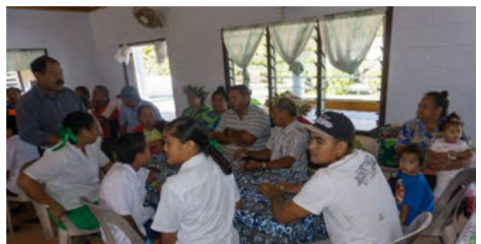
Students and the Community participated in the Raurau Akamatutu and Maroro Tu Workshops.