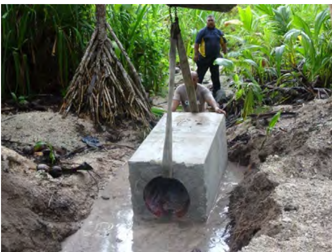
Photo above shows one of the culverts being lifted in position to drain excess water when the taro plantation floods. This project was also part of the SRIC Northern Students workshop outcome, where the students from Pukapuka proposed for fencing around their taro planting area and drainage to prevent further loss of

Pictured above is one of the culverts recently build and ready for transfer to the taro site for installation. Lucky Topetai the SRIC Focal Point worked alongside with the men of Pukapuka in constructing the culverts.