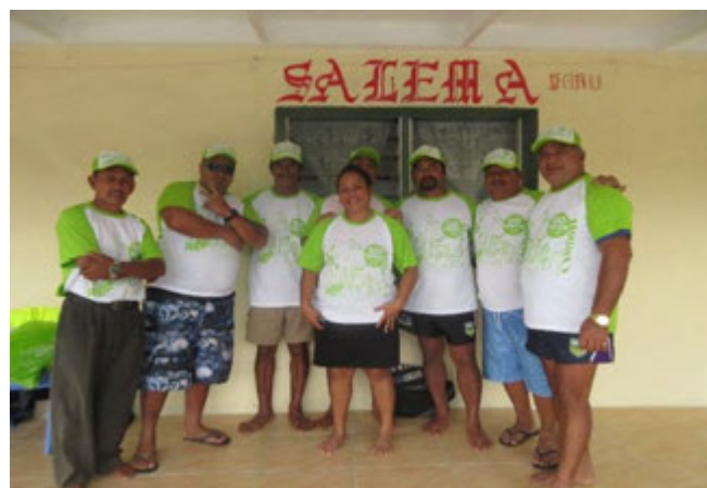
Participants from the islands of Mauke and Atiu for the Marorotu workshop.