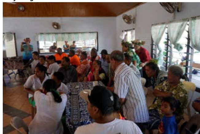
Watching and listening intently to the food demonstration Strategic Planning Retreat 26/28 July