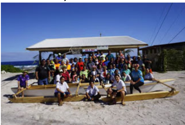
Rere Tu Moana vaka shelter in Mitiaro 11 th July