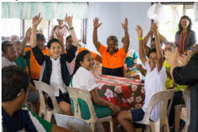
Winning team of the Raurau Akamatutu challenge

The students of Mitiaro were equally proud along with the whole population of just over two hundred that such a historical occasion took place on their island because of them. Well done Mitiaro School and congratulations!