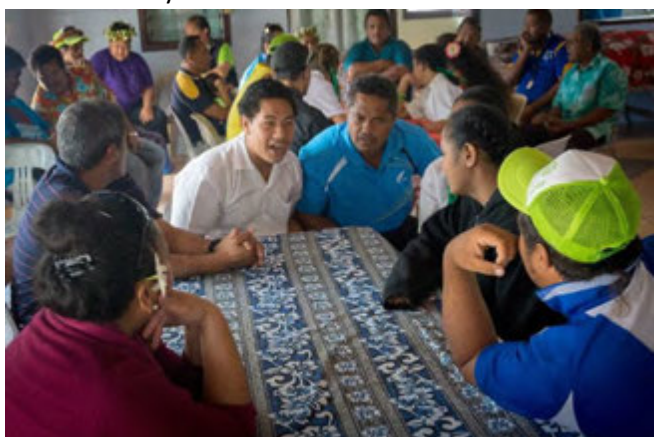
Intense participation and contribution by young and old in the team challenges.

The Raurau Akamatutu workshop was condensed to two half days rather than the four half days previously held in Mangaia. It was packed with team challenges as teams figured out the links between climate change and their daily lives and household activities.