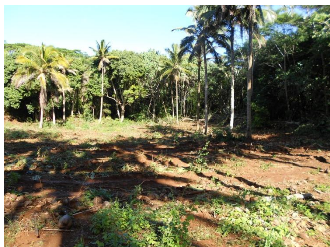
Plot of land in Keia earmarked for the project