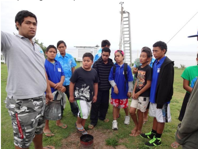
Met Office staff showing students the rain gage

Students were treated to a boat ride to which Dr Rongo covered a range of topics to supplement what they learned in previous lectures at the workshop. These included the influence of land-based activities on the ocean, ocean acidification, atoll and volcanic island formation, and the importance of reefs as natural barriers to the impact of cyclonic waves. Field trips included the Meteorological Office where staff explained the process of collecting, collating and interpreting data to produce weather forecasts.