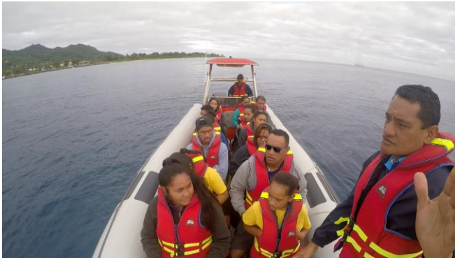
Students on a boat ride sponsored by Te Ipukarea Society (TIS)

carried out on Rarotonga and what is being done by government and private people. Reiterating that adaptation to climate change is not only government's responsibility but everyone's business.