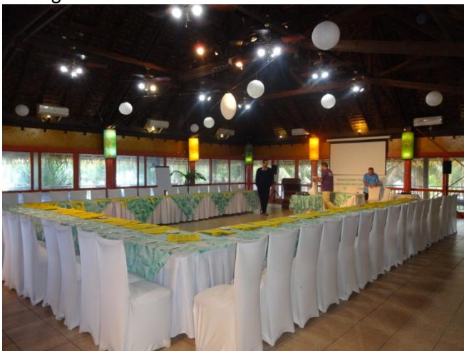
Workshop venue, Raratongan Resort conference room