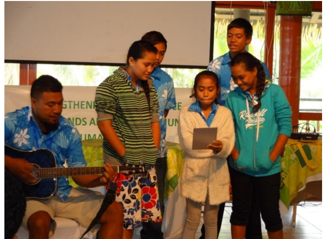
Penryhn students with their teacher performing a song Students from Palmerston Island presented their drama about boats throwing their anchor on the reef and causing damage to their reef and ecosystems.

In the course of four days the students with the help of their teachers worked on their proposals. There were also fun activities to which students created and performed a drama about their chosen project or a song. The Penryhn students were quick to catch on with climate change to which they performed different human activities that cause detrimental impacts on the environment. Rakahanga students without a teacher depicted the actions of humans that cause problems to fish migration and breeding places.