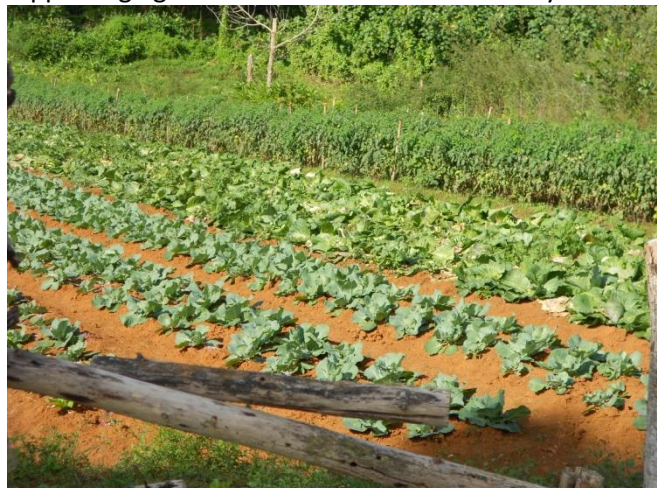
Vegetable garden in Mangaia

They hope to cultivate cabbage, broccoli, cauliflower and tomatoes with the excess earmarked to hit the Rarotonga market by the end of November early December. Farmers in Mangaia are geared up to turning the local economy around to the heydays when Mangaia was central as an agricultural producer in the Cook Islands. SRIC is committed to supporting agriculture to ensure food security.