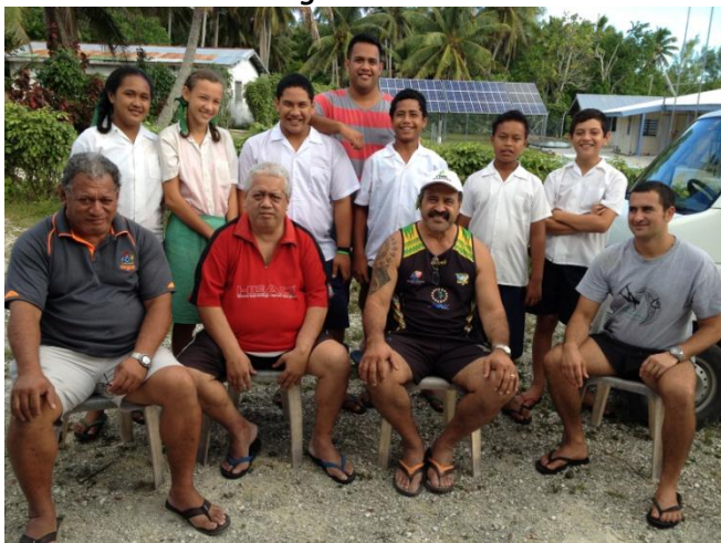
Team from Rarotonga consisting of EMCI, ICI and Red Cross with Mitiaro students who assisted with the project 1-5 June 2015

Emergency Management Cook Islands (EMCI), Red Cross and Infrastructure Cook Islands