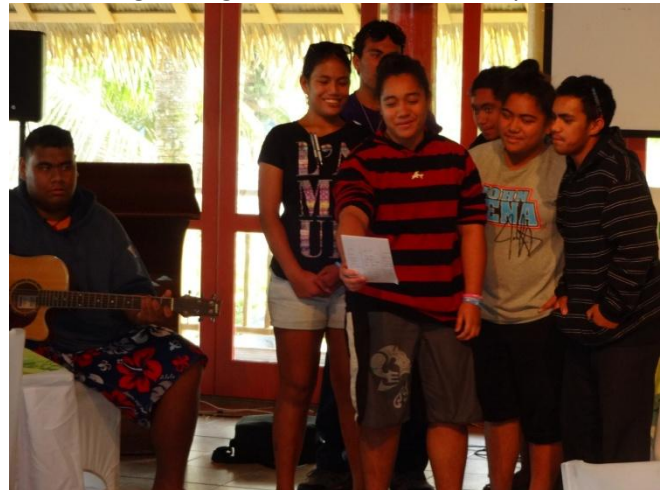
Palmerston students performing a song after their drama Experts from different disciplines spoke on; Geo-Portal, GIS mapping and Seabed Mining.