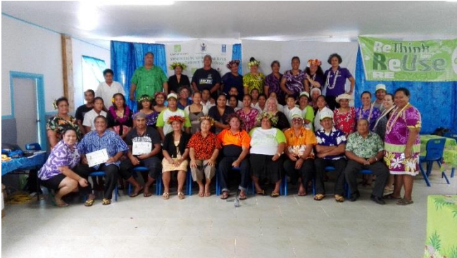
Group photo 30 th June

On the final day of the workshop there were 42 participants who turned up, an additional 11 from the first day of 31. The island Executive Officer commented that usually as days go by attendance dwindles, but this workshop has increased numbers, so it must be exciting and interesting stuff for people wanting to come.