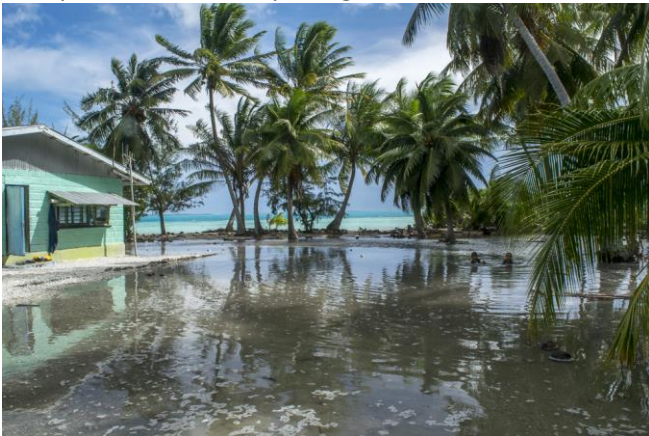
Penryhn island, another king tide is a regular sight

In 2011 Penryhn Island was identified as the site to pilot the USP EU GCCA project. The project is in its 5 th year. An outcome of the project was a V & A community based methodology which identified water security and coastal protection as the two imminent threats from climate change. The situation on Tetautua village across the lagoon is more prominent and would require extensive work with the injection of more funding. As a way forward the island sustainable development plan is aligned with the government budget process to ensure the momentum continues. Despite the inevitable threat of sea level rise, the people of Penryhn is not contemplating relocation.