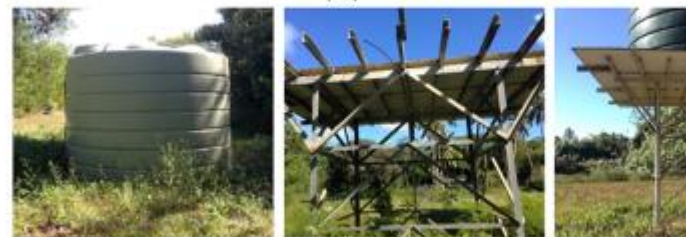
Figure 16 L: The Angiagi tank had no stand. C: The Tinokura station did not ha... R: The Vaimutu tank did not have a proper outlet attached to it.

(slide by Roanna Salunga, Water Engineer, May 2016, OPM)