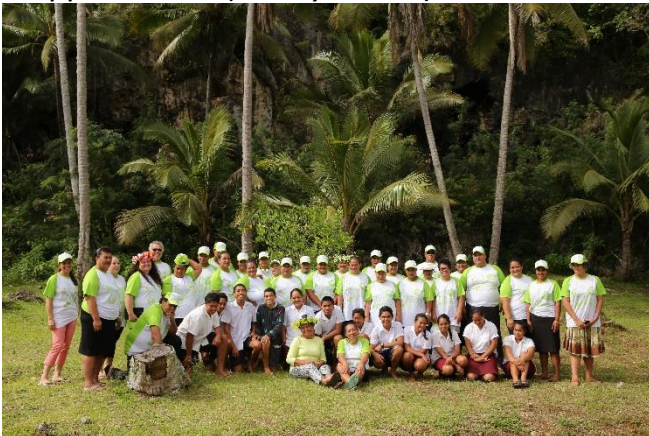
Group photo with yr 10 students who joined the workshop