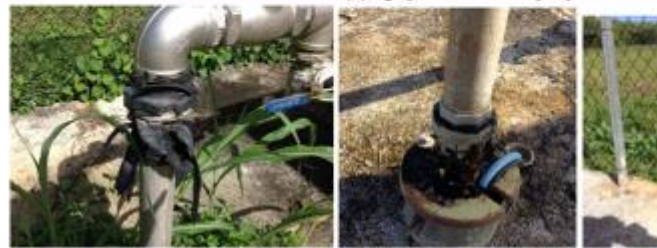
Figure 6 L: Leaky joint inadequately repaired at Mokoero station. C: Moss growth at the b... R: Moss growth at the piping joint at MUK-4A.