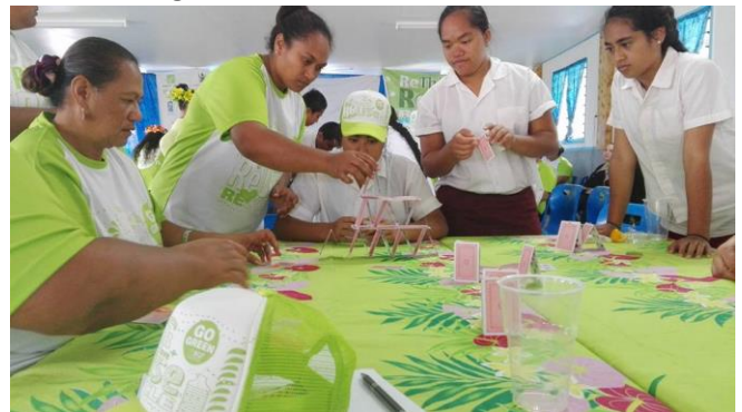
Young and old working together on a group activity.

participants to be resilient and adaptable with Climate Change, exchange ideas of traditional food preservation practices, Impacts of climate change on food security, water, health, agriculture and fishing practices. Participants were in awe of the many delicious, healthy and simple dishes whipped up by Cook Islands Chefs Rangi Mitaera-Johnson and Josie Rattle-Wichman who showcased how to make delicious meals using locally grown fresh produce in innovative ways from taro mince patties, pawpaw & star fruit salsa, and coconut, chilli and green onion sauce amongst others.