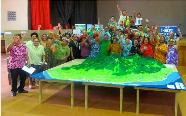
Final day of the 3D modelling workshop 17 June Aroa Nui Hall