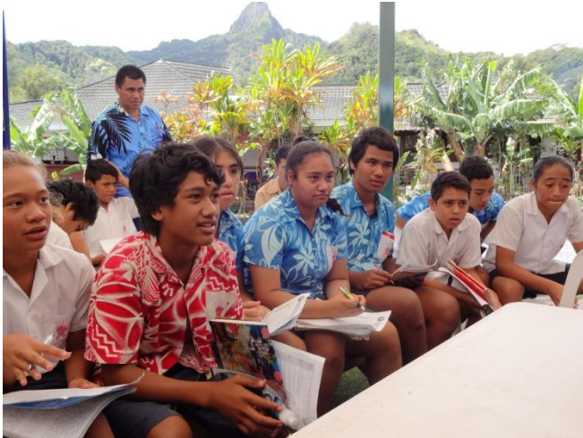
Students very much in touch with their environment