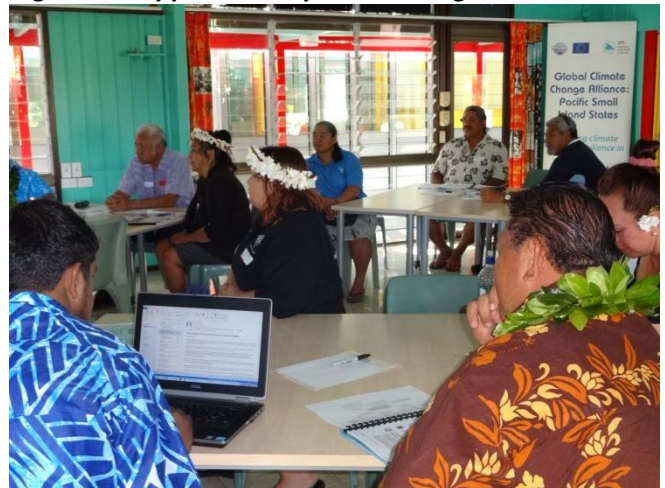
Participants at the opening of the workshop 19Oct

The workshop kicked off to a good start with a total of twenty two participants mainly from community groups, non-government organisations, individuals and from the Pa Enua. In the course of the training, participants learned to develop a proposal using the log frame approach, which entailed working in groups thus promoting community collaboration and ownership of projects.