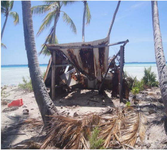
Akasusa where the hut will be transformed to a science lab for students working on turtle tagging