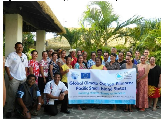
First LFA workshop in 2013 held at Crown Beach

With support from SPC EU-GCCA: PSIS & the SRIC-CC Programme, the Climate Change Cook Islands Division of the OPM will be conducting a four day project/program proposal writing workshop from the 19th to the 22nd of October, 2015. The workshop will focus on the Logical Framework Approach as the tool to design, monitor and evaluate development projects/programs. This workshop is a follow-up to