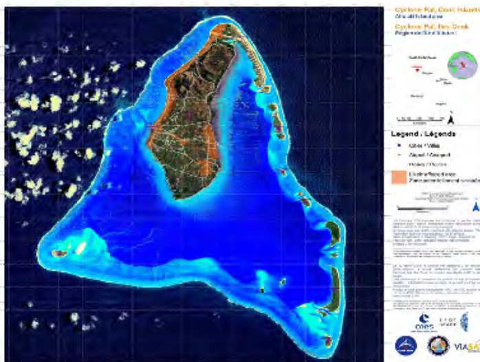
Map of Aitutaki and indication of impacted areas (EMCI)

The relief response to immediate humanitarian needs was carried out successfully with almost all key relief needs being taken in to account within a two week period. UNDAC deployed to the Cook Islands at the request of EMCI advised by their initial assessments of the damage caused by Tropical Cyclone Pat and emerging humanitarian needs. A series of rapid assessments were undertaken by the Red Cross,